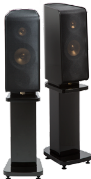
< black piano-lacquer >