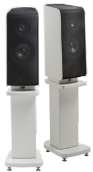
< white piano-lacquer >