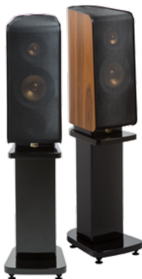
< dark oak >