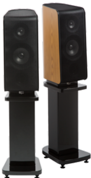
< light oak >